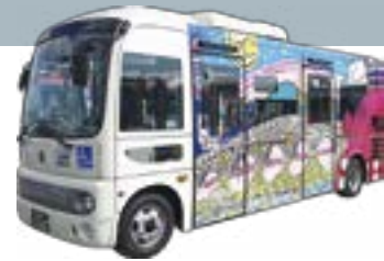
Artwork featuring Bandai Bridge, designed by Shunsuke

Fare-one ride Adult 210 JPY Child 110 JPY One-day Pass Adult 500 JPY Child 250 JPY